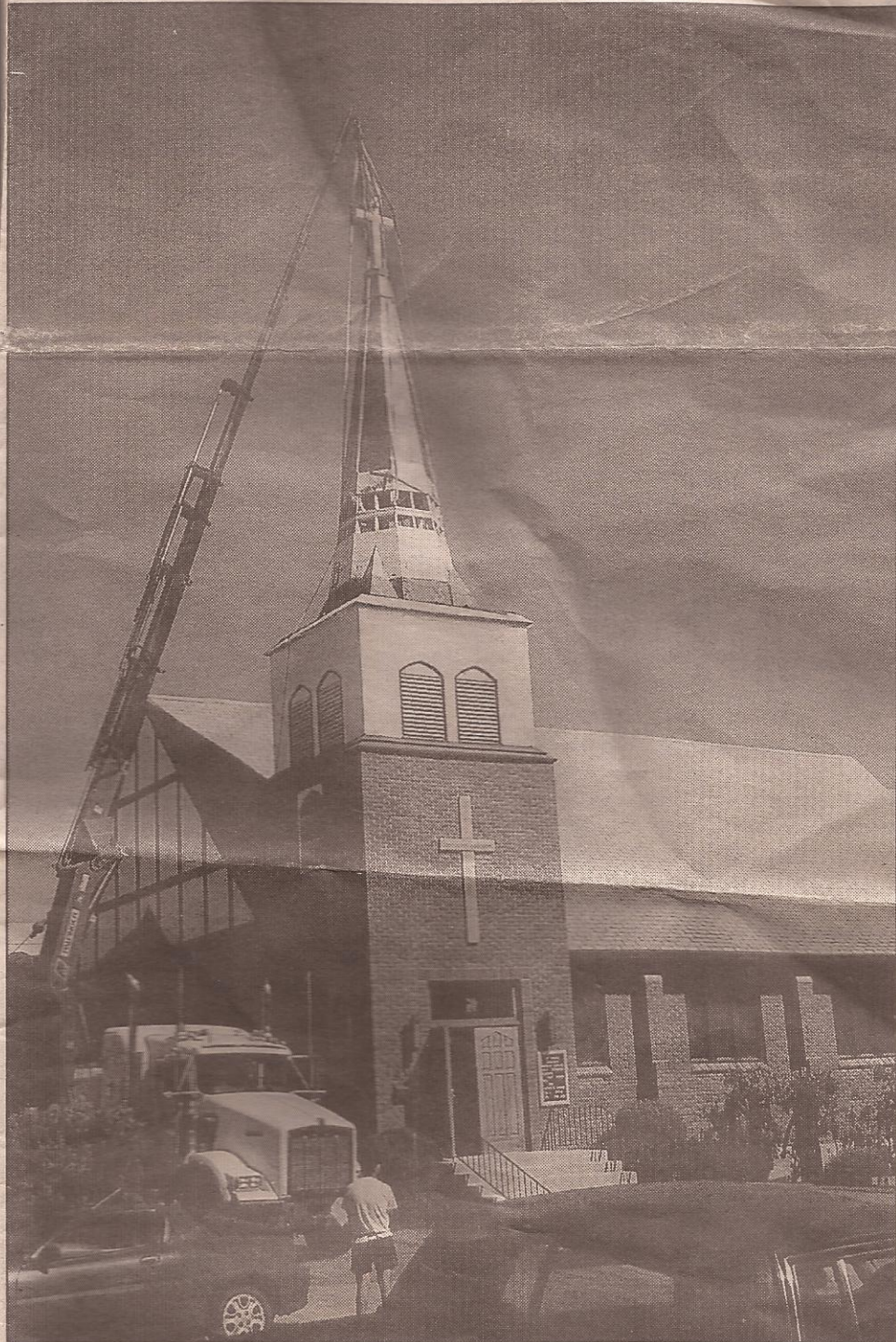
LAST PIECE: Crane jockeys steeple into place at St. Mark's

Moments of Grace Page 2 Diocesan Calendar Page 5 Around the Diocese Page 6 Cycle of Prayer Page 6